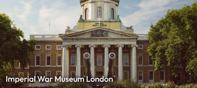
Imperial War Museum London