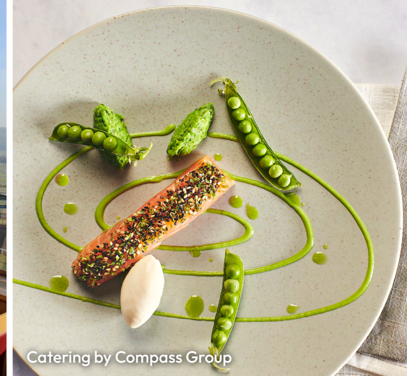
Catering by Compass Group