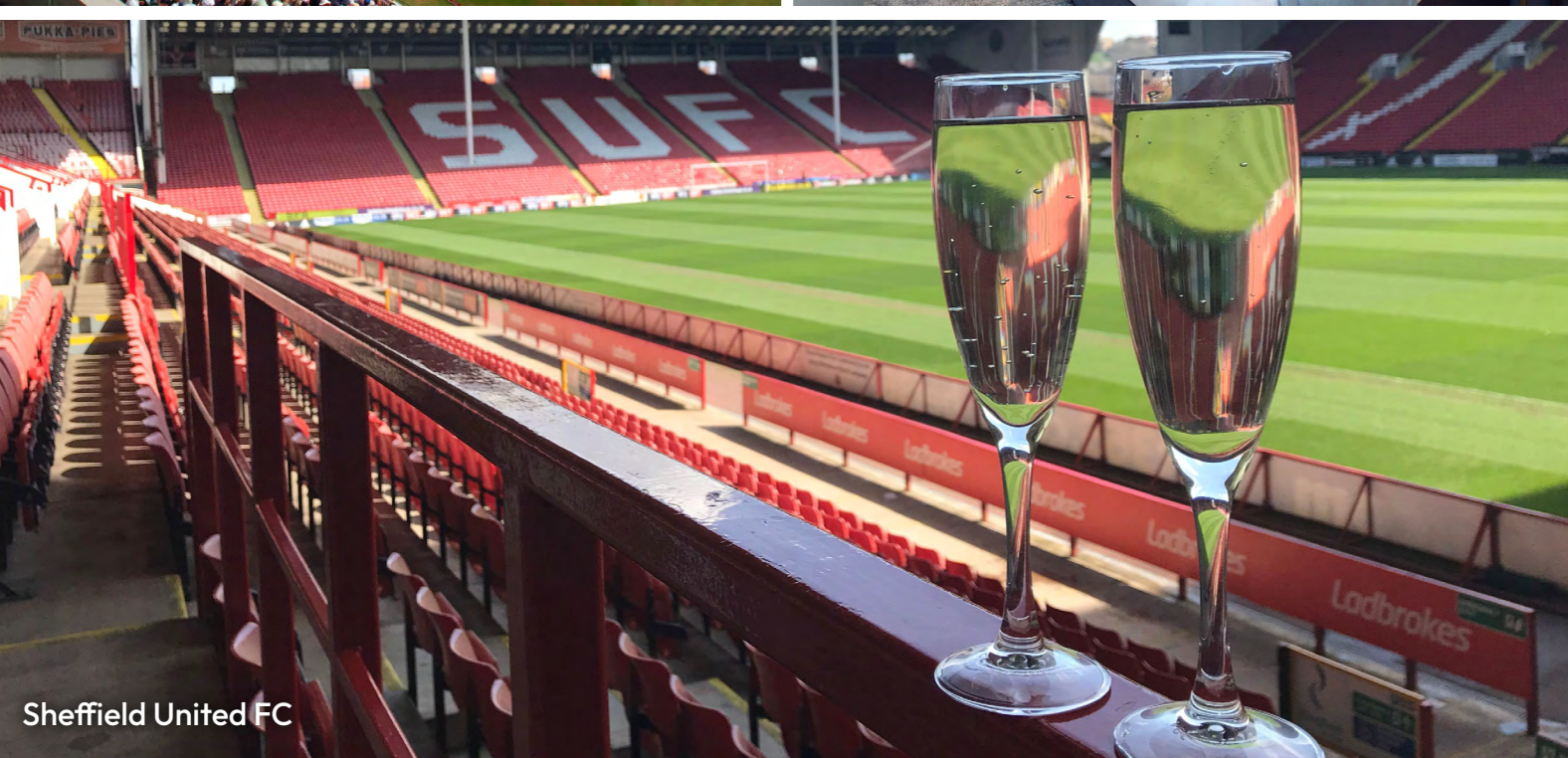
Sheffield United FC

Lime Venue Portfolio is the UK's largest collection of venues, but we offer much more than just event spaces. We make it easy for event organisers to arrange their events, exceeding expectations with award winning speedy service, championing greener events and providing WOW venues with world-class catering.