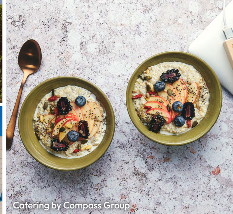
Catering by Compass Group